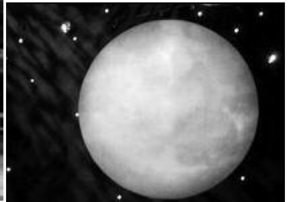
(below) Cast of CATS