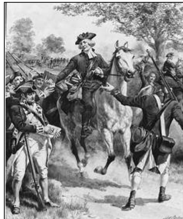
(above) Artist's rendering of Rev. James Caldwell, nicknamed "the fighting parson," at the Battle of Springfield, in June 1780. He was shot dead a little more than a year later.