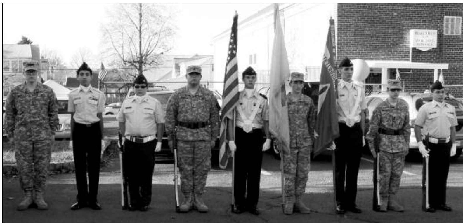
(above) Color Guard made up of Union High School's JROTC and Civil Air Patrol's Teterboro Composite Squadron.

Renna Media, LLC 202 Walnut Avenue, Cranford, NJ 07016