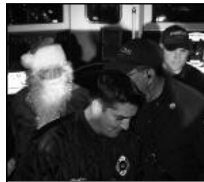
(above) Santa arrived by fire truck and was escorted by firemen.

There will be free Horse Drawn Wagon Rides on Friday evenings from 5:00 to 8:00 PM on December 21 in front of the Union Movie Theater. Christmas Carolers will also be strolling through Union Center during the holiday season.