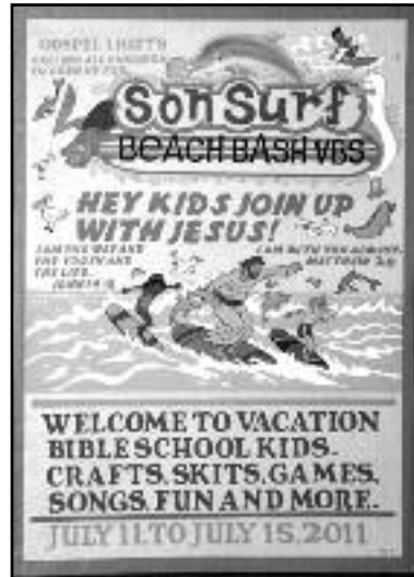
(left) Bible camp posters show a bit of humor in Decesare's art. Here, Jesus is shown surfing.