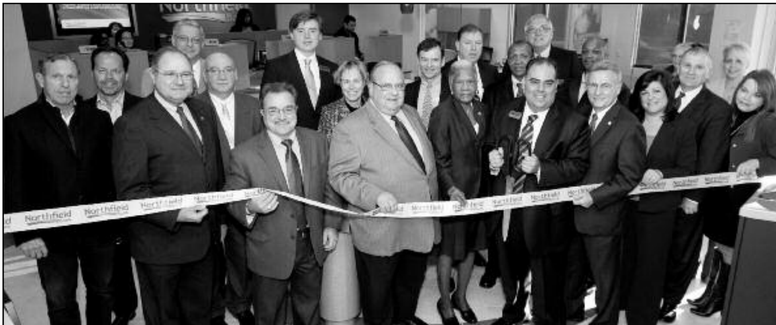
(above) Northfield Bank continued to demonstrate its commitment to the community during the Union Office Ribbon Cutting Ceremony by making donations to the YMCA of the Eastern Union County, the Boys and Girls Clubs of Union County, and the Community FoodBank of New Jersey. Representatives of these three charities join Northfield Bank employees and local officials to cut the ribbon for the opening of the Union Office.

Renna Media, LLC 202 Walnut Avenue, Cranford, NJ 07016