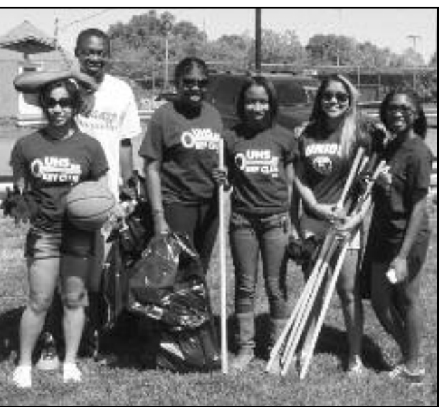
(above) Burnet Middle School Freshman Class Key Club.