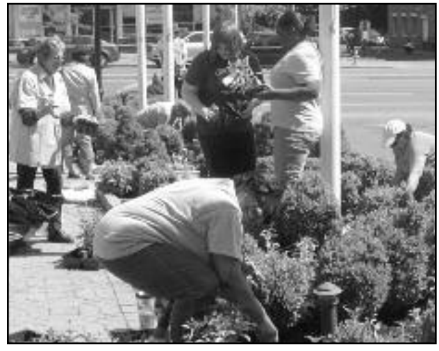
(above) Garden Club members pitch in yearly and beautify Town Hall by planting flowers.

Due to the 4th of July Holiday, the Union Garden Club will be meeting Wed, July 11, in the Bonnel Room of Town Hall Morris Av, 7 pm. We will discuss the upkeep of the beautiful gardens we planted in front of Town Hall as well as other horticultural issues. New members are welcome to join us and partake in the care of the gardens and refreshments are served.