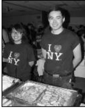
Morris Thai Cuisine