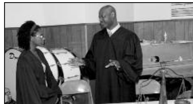
See photo album on pages 8 & 9!