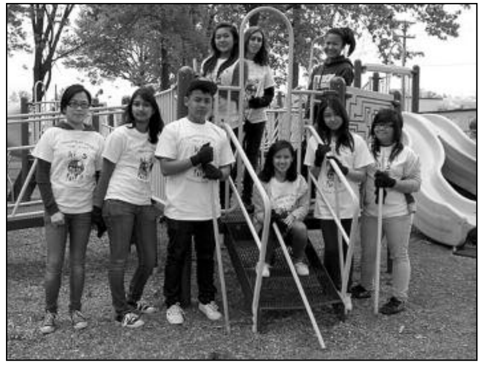
(above) Union High School Key Club cleaned up Rabkin Park.