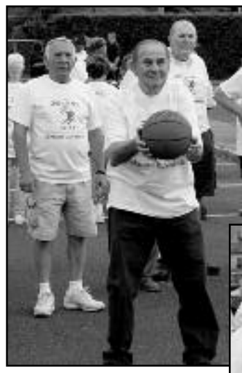
The Township of Union worked in cooperation with Union Center SID, Union Municipal Drug Alliance, Think Express Pharmacy, Italian American Club, Aquinas Healthcare and Elmora Pharmacy.

The Township of Union's Division of Senior Citizens and Recreation held a Senior Olympics on June 4th at the Senor Center on Bonnel Ct. Residents over 60 years old competed in seven events of skill and athleticism including Discus Throw (frisbee), Ice Skating (Egg on spoon race) Archery (Darts), basketball - free thows, Pool - eight ball, and walking marathon. (60 meter).