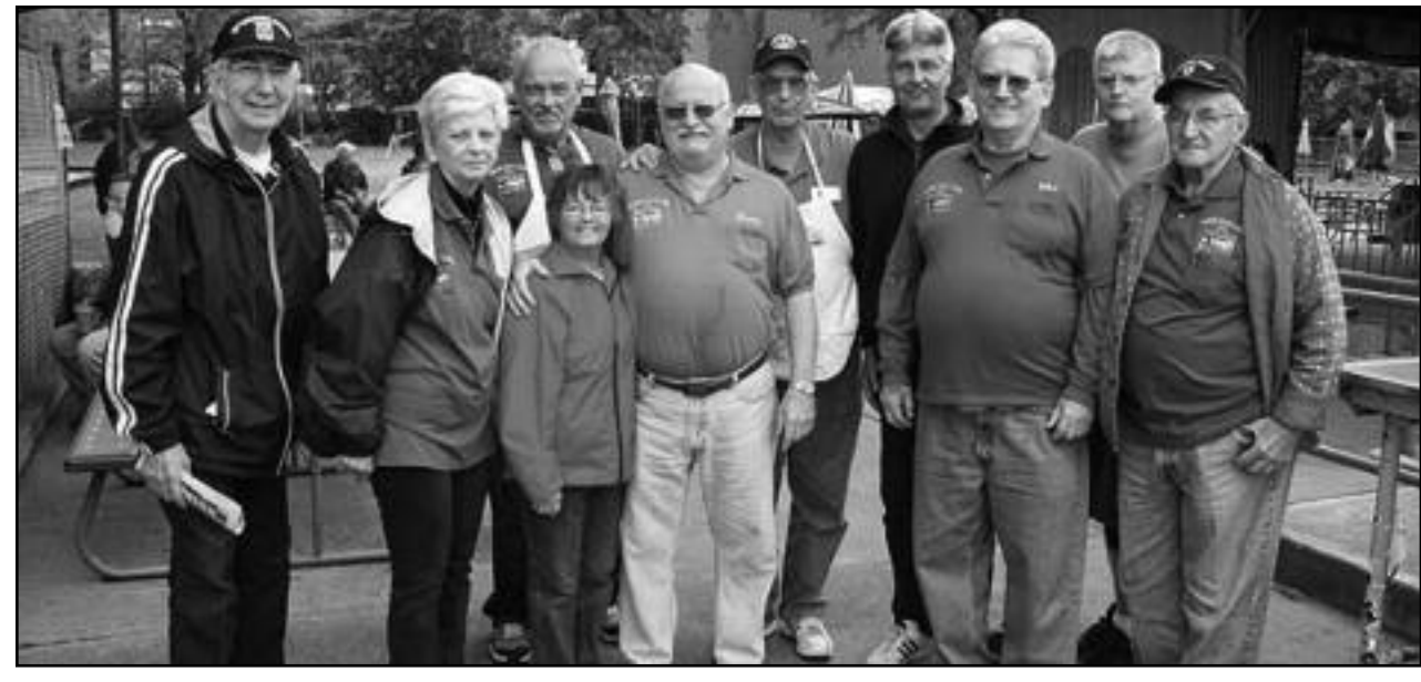
(above) Members of the Union Elks Club Lodge 1583 Veterans Committee.

The Union Elk's Club, Lodge 1583, located Committee oversaw the development of Veterans Memorial Park and raised funds for hospitalized vets. They also shipped 5,000 lbs of care packages to veterans and active duty soldiers.