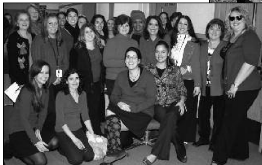
The Staff of Hannah Caldwell Elementary School participated in a school-wide wear red event to celebrate National Go Red Day on February 4th. All donations went to the American Heart Association with students joining in to support the cause as well.

The Builders Club (the service club of Burnet Middle School) has been working very hard raising money to combat heart disease for the American Heart Association. In celebration of Heart Month, the Builders Club sponsored three worthwhile fundraisers. First, they sold red paper hearts in honor of or in memory of loved ones, secondly, they held a Pre-Valentine's Bake Sale after school and lastly, they held the annual Hoops for Heart Foul Shooting Contest. Burnet Middle School definitely has heart. They raised $646.84 for the American Heart Association.