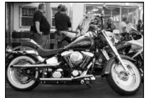
(above) The show also features newer tricked out cars and Motorcycles.