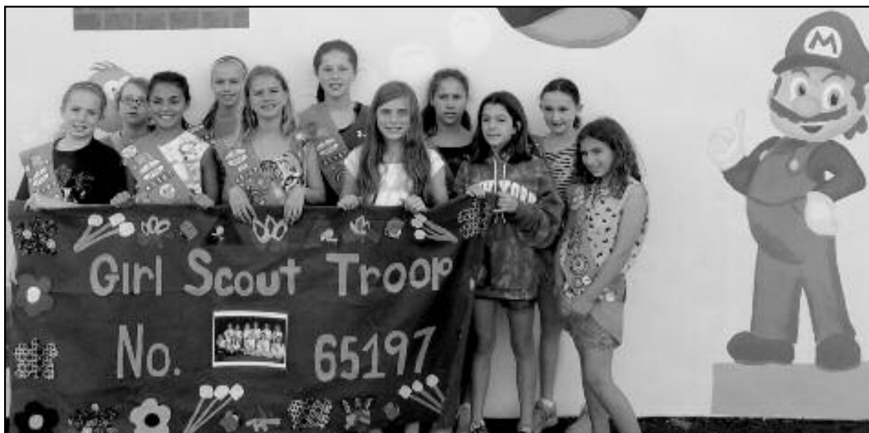
(above) Colorful and exciting mural ready for "Wall Ball."

Established in 2004, the Arboretum is a non-profit 501(c)(3) organization that provides environmental and horticultural education of children and adults through the development of plant life in a natural suburban learning setting. The Arboretum offers on-going events and programs for children and adults. For more information call 908-350-7383 or visit our web site at www.wfafnj.org .