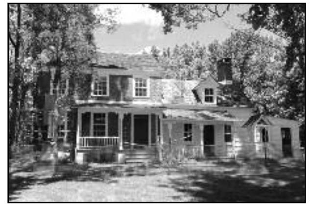
(above) Kirch-Ford-Terrill House undergoing renovations.

The current restorations of The Kirch-Ford-Terrill house, circa 1750, are almost complete. The house was first acquired by Warren Township in 1980. No major restoration has been done since that time. The current restoration project was defined after discussions with the project's architect and preservation consultant. The project consists of repairing and restoring the brick façade on the front of the house as well as restoring more than half of the windows. After removing the paint on the brick façade in order to make brick and mortar repairs, the Historic Sites Committee felt this change was an improvement to the look of the house. Also, the building now looked like it did in the earlier photos of the building. So after all the positive feedback received about the look of the building, the committee decided to leave it unpainted going forward. The house should be open to the public again in September, and will be open for Somerset County's annual