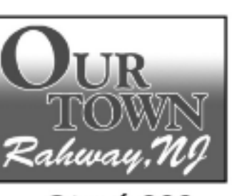
Qty: 4,000 and businesses. 1,000 dropped at ditribution points.