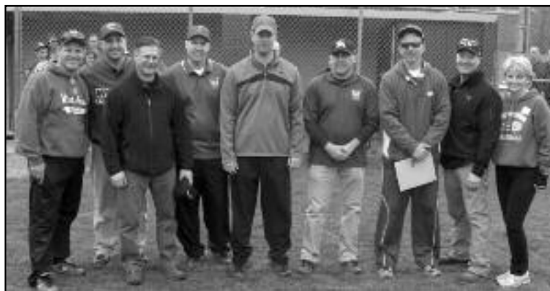
(above) Several Watchung Little League Volunteer Coaches and League Managers had a busy and splendid Opening Day.