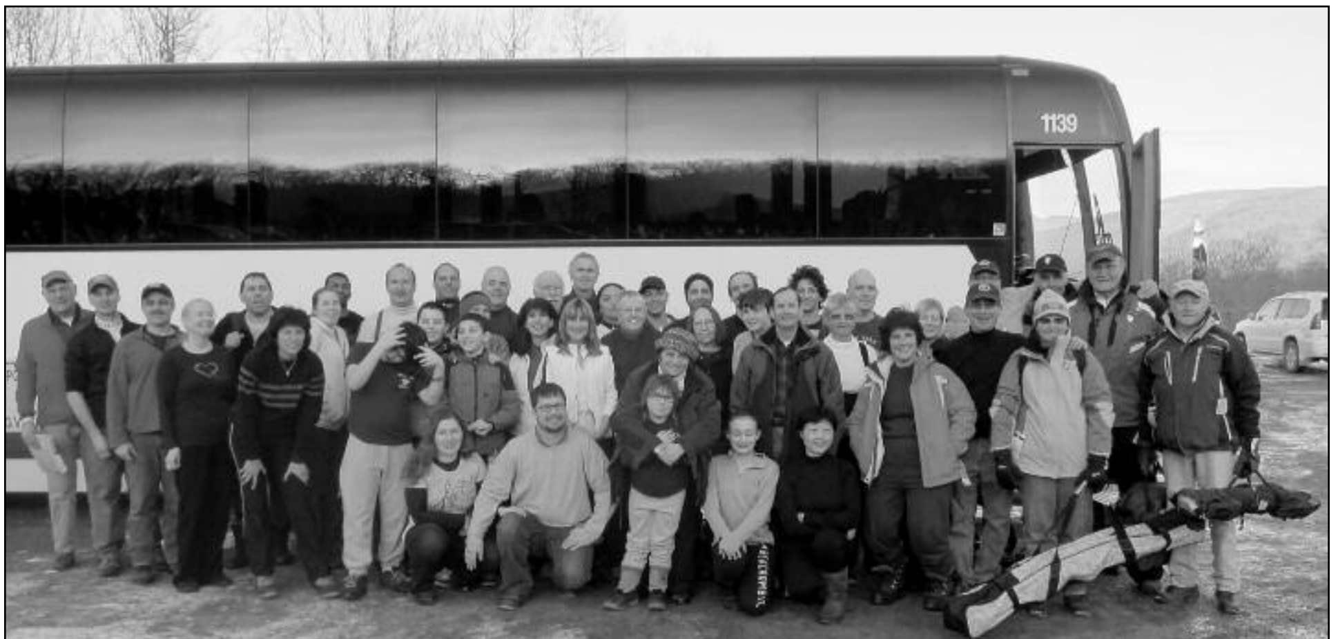
The Watchung Amateur Ski Club welcomes skiers and snowboarders of all ages and abilities. At the conclusion of a recent Sunday Ski Bus Day Trip to Belleayre Mountain, NY, the group gathered for a photo in front of the "Ski Bus."