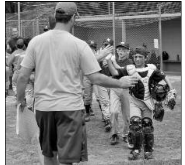
(above) End of game congratulations, Yankees win championship game