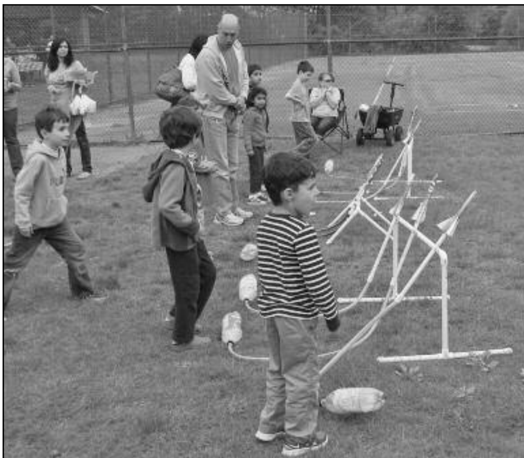
(above) Happy Kids Prepare to Launch Another Round of Pack 32 Supplied Stomp Rockets