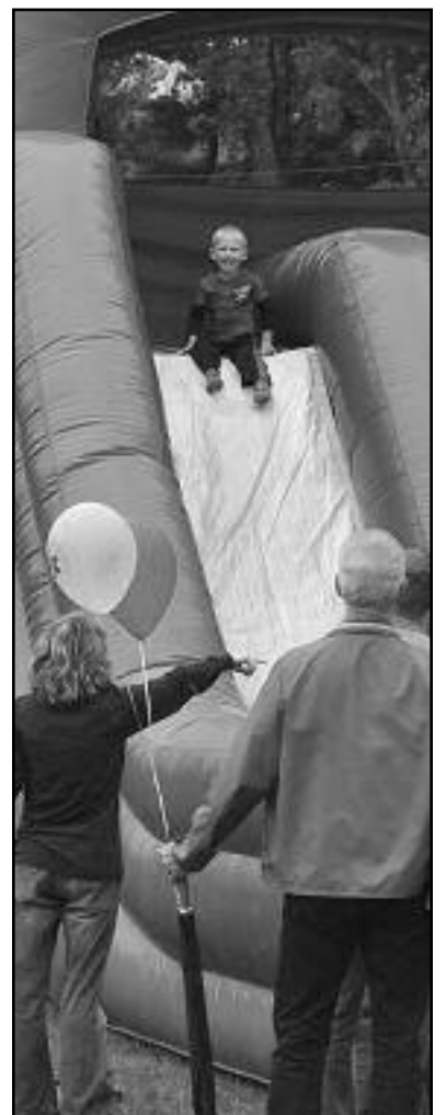
(above) Young Boy gets to the final challenge on inflatable obstacle course