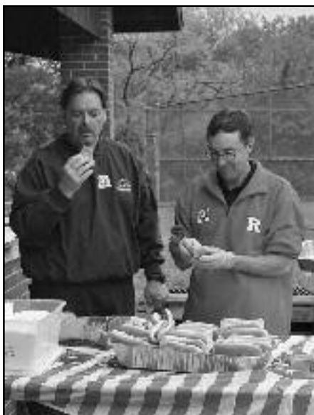
(above) Complimentary Hot Dogs Served for All by Watchung Recreation Commission.