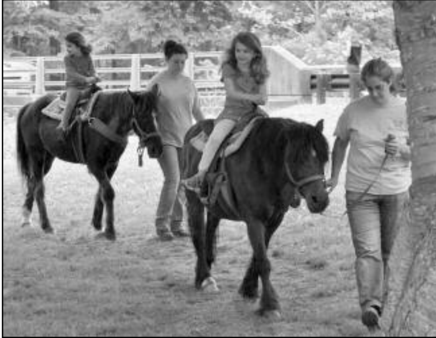
(above) Cowgirls enjoy free pony rides