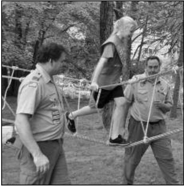
(above) Girl Scout crosses B.S. Troop 32's Rope Bridge