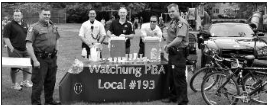
(above) PBA Provides Refreshments and Displays Patrol Bikes and Car.