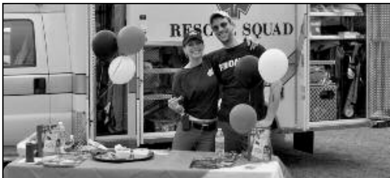
(above) Watchung Rescue Squad and TGI Friday's Partner to Offer Delicious Snacks

demonstrations, music, games, and free mini train and pony rides. Of course, it wouldn't be a picnic without food like hot dogs and Italian ices to eat outdoors with friends and family.