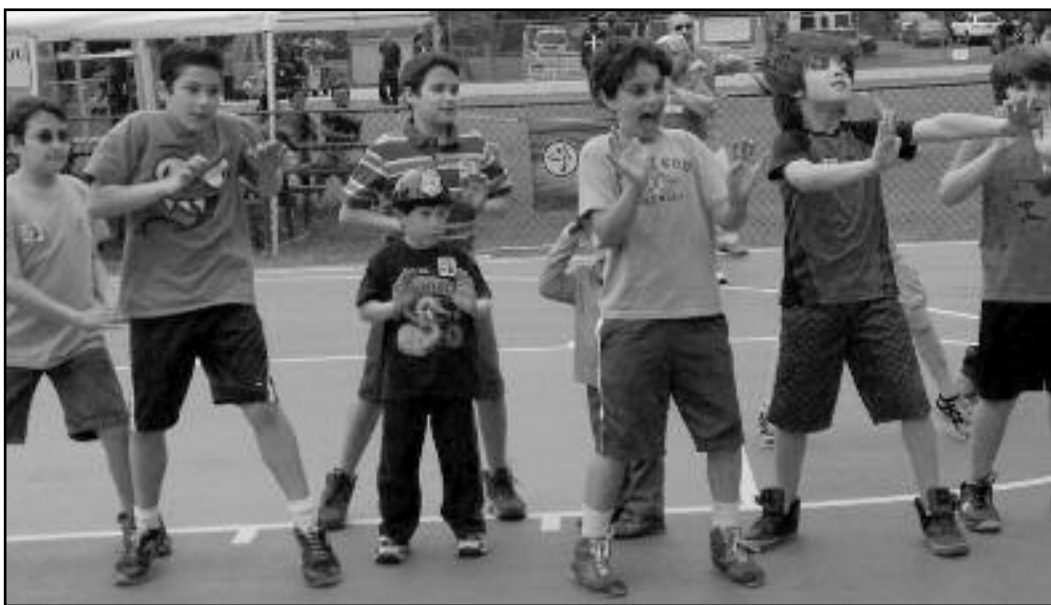
(above) Boys Zumba Dance