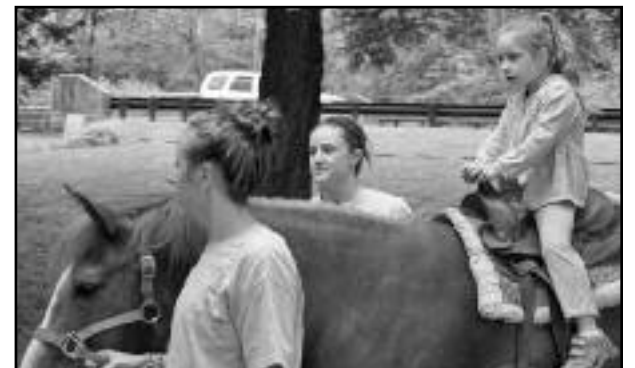
(above) Pony rides were a big hit.