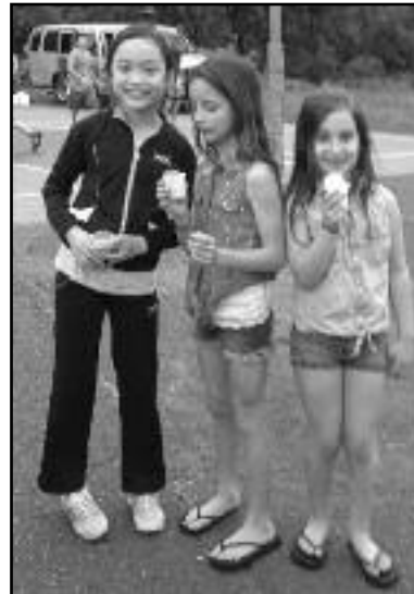
(above) Girls enjoy complimentary Ices.