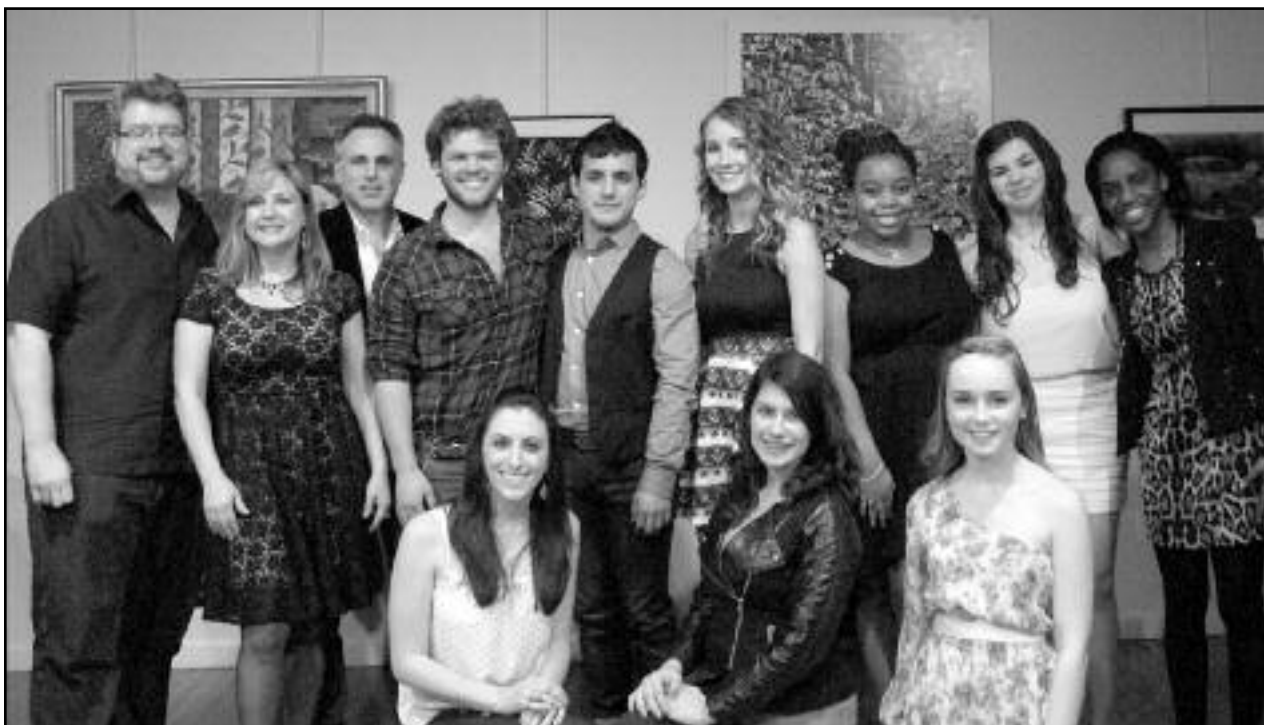
(above) 2013 Vocal Competition - NJ IDOL Semi-finalists with judges.