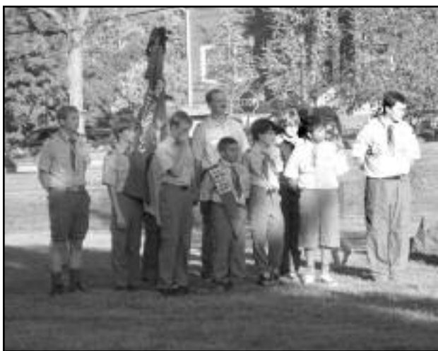
(above) Boy Scout Troop 32 leads the ceremony in The Pledge of Allegiance.