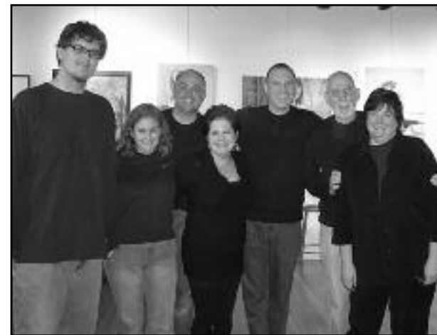
(above) The Improvables will be providing audiences with outlandish humor, 8 p.m. at the WAC on Saturday, October 13 (Family Improv) and Saturday, November 17 (Adult Improv)

Information about WAC programs can be found on-line at WatchungArts.org or by calling 908-753-0190.