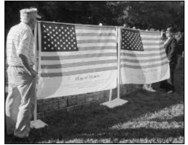
(above) The "Flag of Heroes", which lists the names of all those lost on 9/11, is displayed at the ceremony.