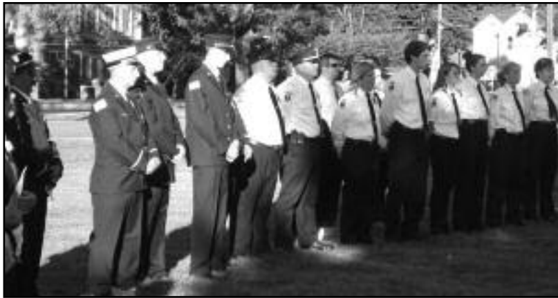
(above) Watchung's Fire and Rescue Squad.