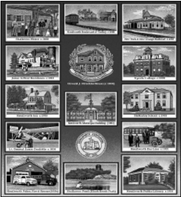
Kenilworth Historical Society Commemorative Coverlet