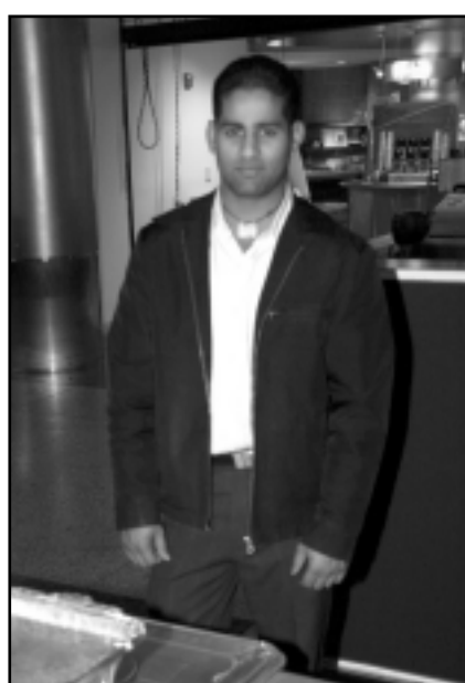
Star of India