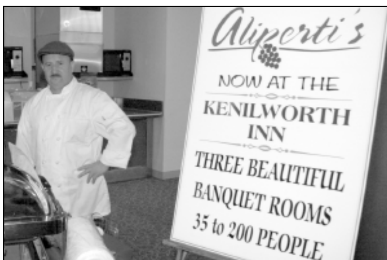
Aliperti's located at the Kenilworth Inn