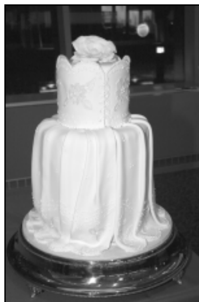
A Bella Palermo creation