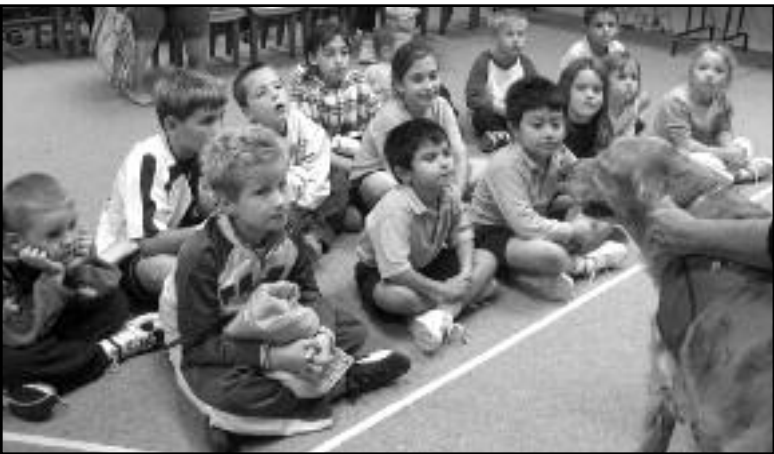
(above) Children learn about the program.