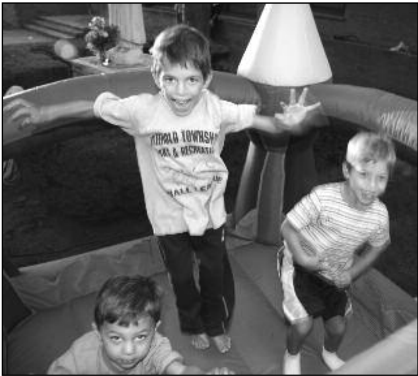
(above & below) There was a lot of activity from football to a moon bounce.