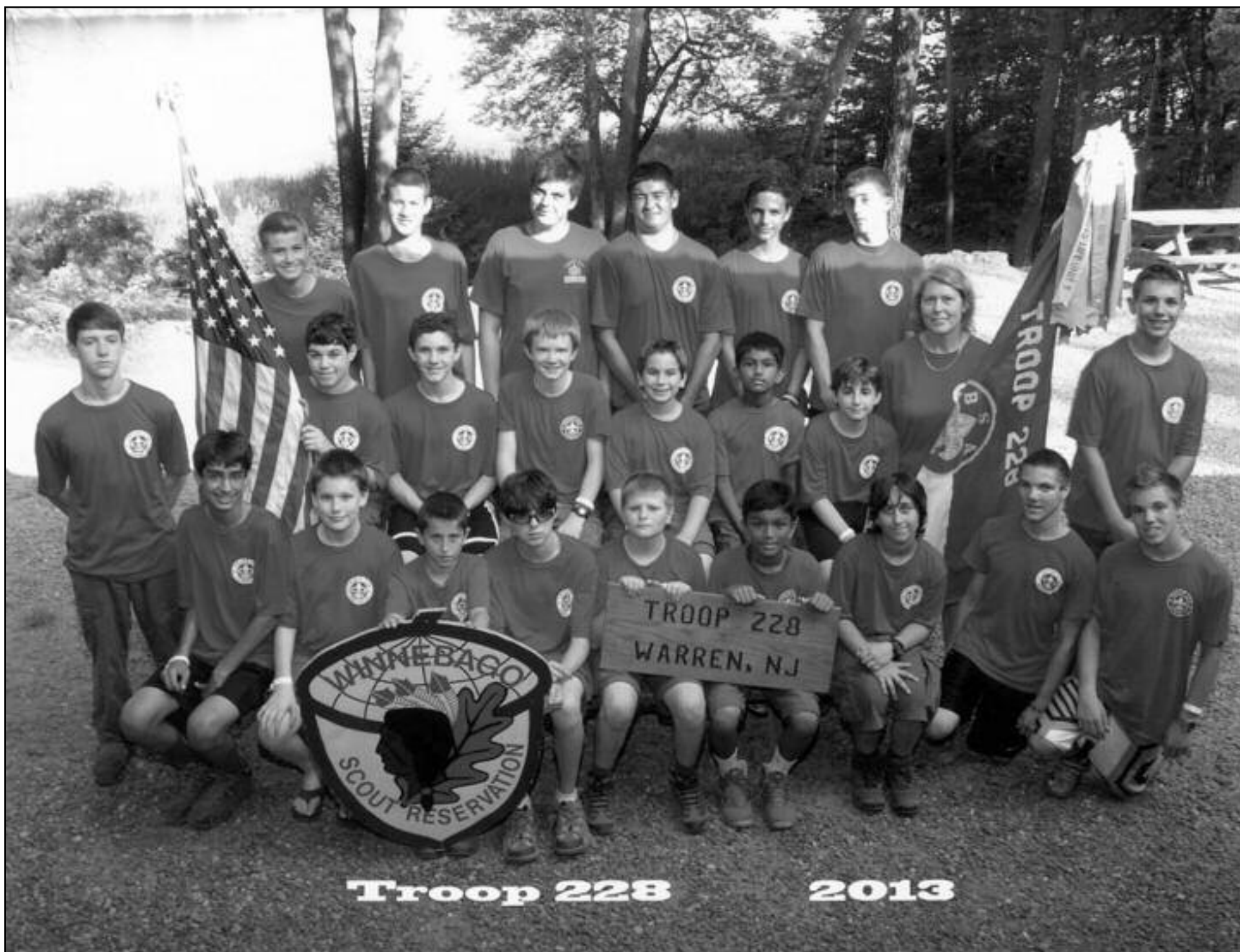
(above) Twenty-four scouts from Troop 228 on their second camping trip this summer. These scouts had a wonderful time at Winnebago Scout Reservation in Rockaway, NJ.