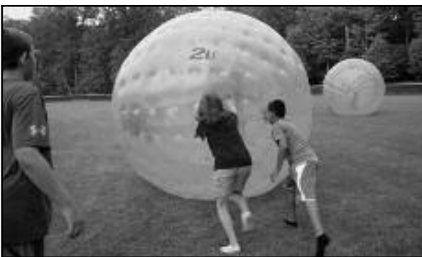
(above) Teens had a blast at this innovative and fun summer program sponsored by the Young Adult Dept at the Warren Township library. It was 360° of fun with these giant inflatable ball races on the fields next to the library.