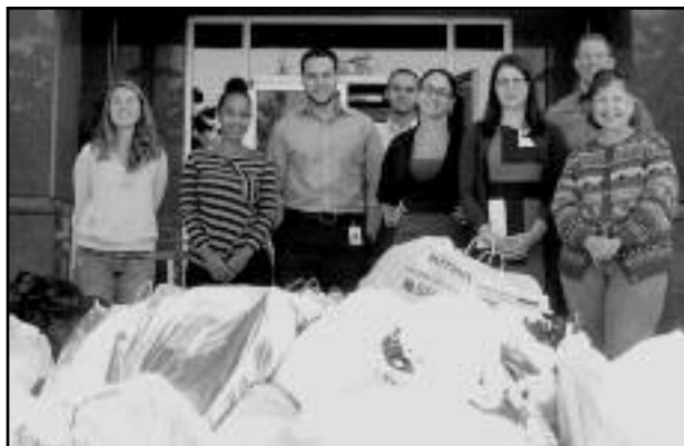
(above) Representatives of Joshua's Closet and clothing drive participants of Chubb Insurance.

New Brunswick, NJ. For more information about Joshua's Closet, please find them on Facebook or email joshuasclinet@live.com