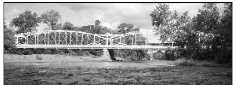
(above) New to the tour this year is the Elm Street Bridge, Elm Street (CR 667) at intersection with River Road (CR 567) between Hillsborough & Branchburg Townships. The Elm Street Bridge, one of the last remaining of its type in the State, consists of two (2) single span lenticular through trusses over the South Branch of the Raritan River between Branchburg and Hillsborough Townships. The bridge was constructed in 1896, stiffened in 1932 and rehabilitated for continued vehicular use in 1984.

Visit: www.SCHistoryWeekend.com for comprehensive details about this annual event, and to access the 24 mystery photos for this year's What in the World is That?...kids/family detective investigation activity. Free