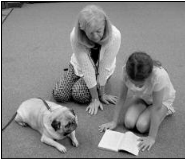
(above) During the library's children's program, Creature Comfort-Let's Read! Children got the opportunity to share a book of their choice with a dog for 5 minutes. Dogs are very good listeners! These dogs are registered pet therapy dogs with Creature Comfort Pet Therapy, Morris Plains, NJ.