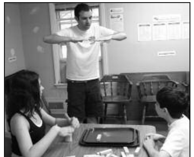
(above) Tectonic Plates in Action.