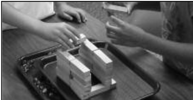
(above) Mad Science-Aspiring Engineers.