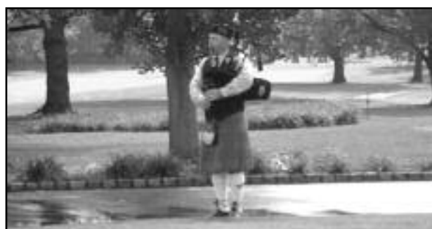
(above) The Irish Business Association will return to Twin Brooks Country Club for its 2013 Annual Golf Outing being held Thursday, September 19.

The Irish Business Association is an association of New Jersey business professionals and business owners launched in March 2008, committed to promoting business relationships and personal interaction within the Irish-American business community in New Jersey, based on a shared heritage. The IBA is part of the Gateway Regional Chamber of Commerce, the largest business association in the New York/Northern New Jersey Region, comprising 14 regional and local chambers. With 1,200 members, the Gateway Regional Chamber of Commerce has a 95 percent retention rate, the highest in the country.