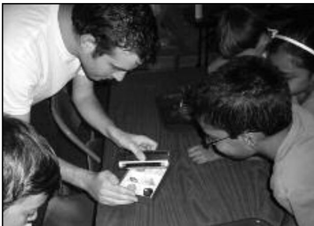
(above) Looking at Fluorescent Rocks.