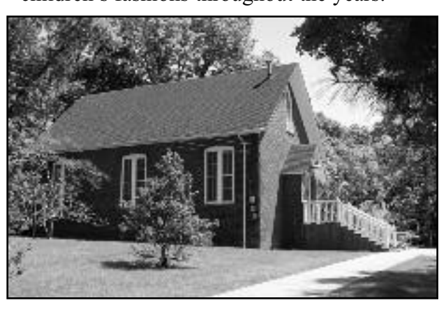
(above) New to the tour this year is the Millstone Schoolhouse/Borough Hall 1353 Main Street, Millstone, NJ. This one-room brick schoolhouse, built in 1860 on the west bank of the Millstone River.

(left) New to the tour this year is the Elm Street Bridge, Elm Street at intersection with River Road between Hillsborough & Branchburg Townships. The Elm Street Bridge, one of the last remaining of its type in the State, consists of two (2) single span lenticular through trusses over the South Branch of the Raritan River between Branchburg and Hillsborough Townships.