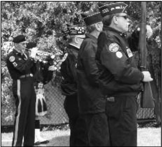
(above) Taps & 21 gun salute.