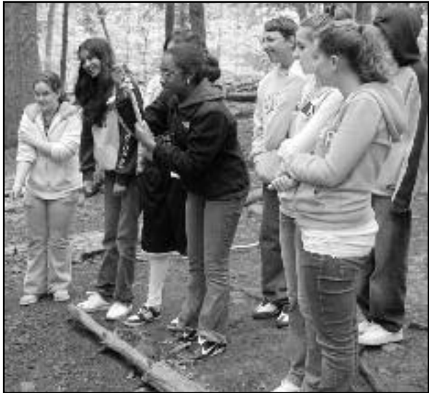
(above) 2009 7th Grade Science Field Trip.

On Monday, May 04, 2009, the David Brearley Middle School seventh grade students experienced hands-on learning, problem-solving, and team-building at the Fairview Lake Y.M.C.A. Camp located in Newton, New Jersey. The Fairview Lake Y.M.C.A. Camp is an accredited campsite that offers access to the Delaware River, Appalachian Trail, and unlimited hiking of the Kittatinny Mountain Range. While hiking, the students discussed and experienced several very serious environmental issues such as: erosion, deforestation, pollution, non-point source pollution, and human impacts and interventions on the environment.