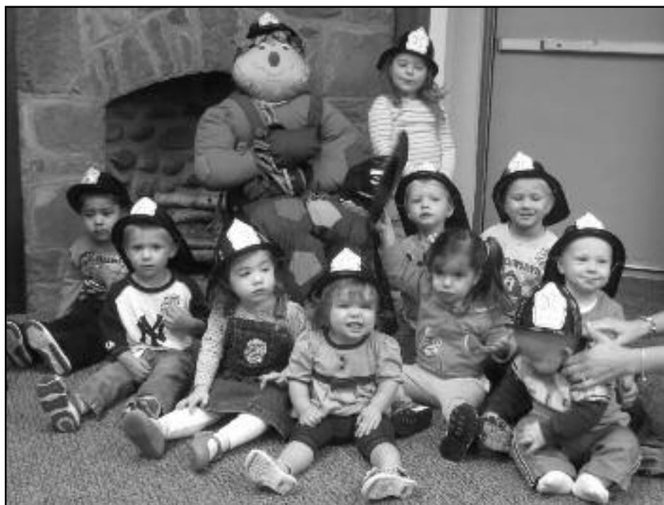
(above) National Fire Prevention Week was recently celebrated at the Kenilworth Public Library. Children listened to stories about firefighters, and participated in interactive activities. Children received Junior Firefighter helmets and sticker badges donated by the Kenilworth Volunteer Fire Department.