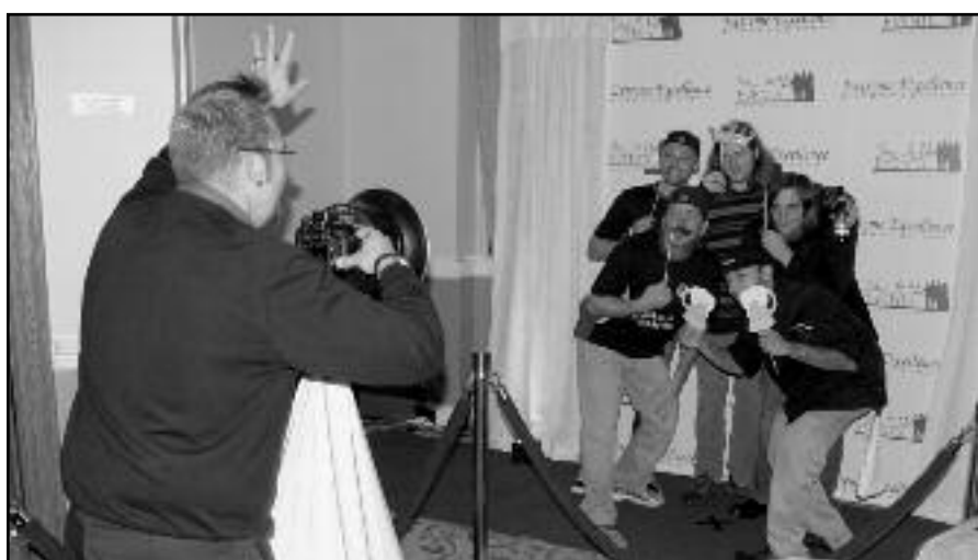
Step It Up Events Donated photo souvenirs.