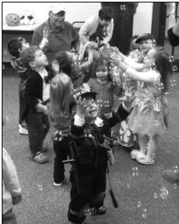
(above) Children and their caregivers celebrate Halloween during a Toddler Time program at The Kenilworth Public Library.