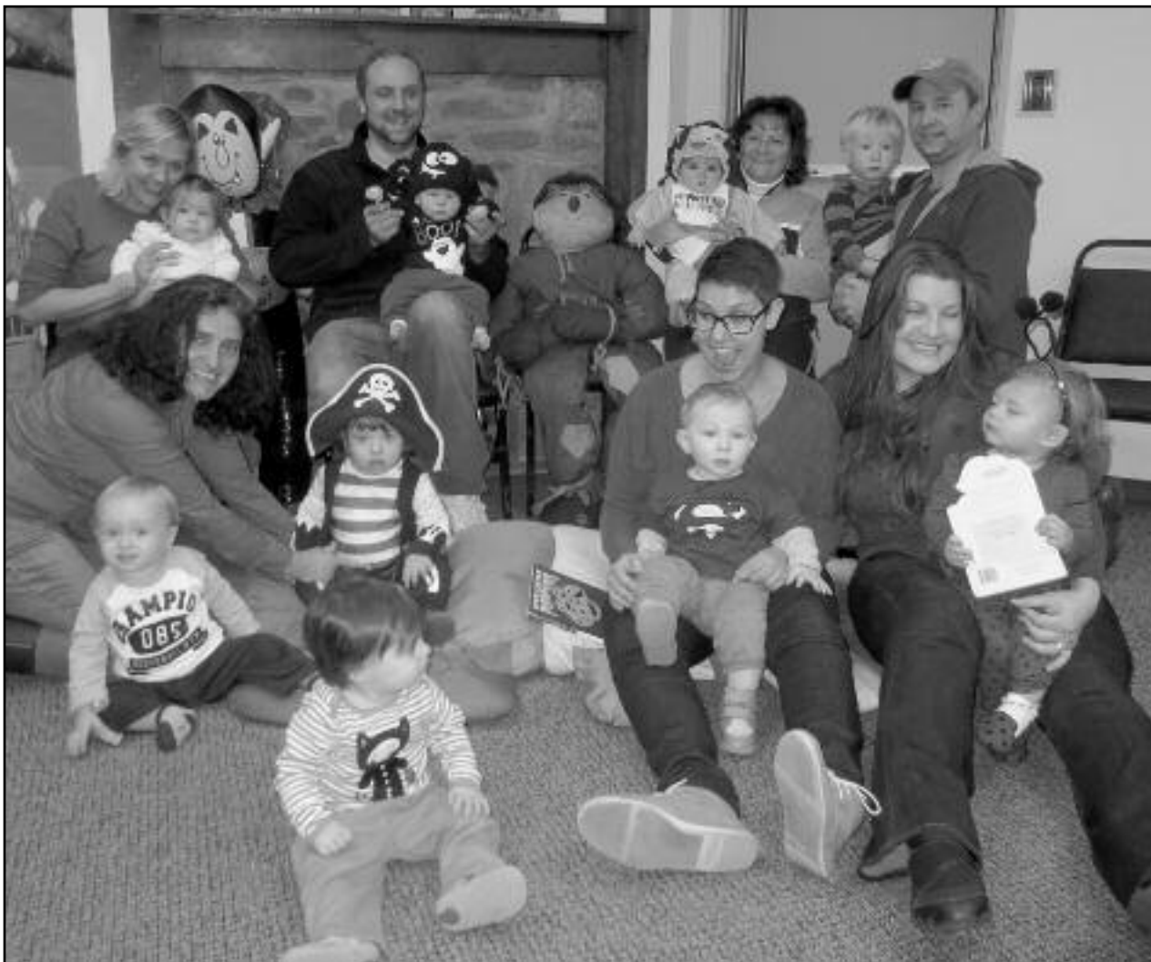
(above) Children and their caregivers celebrate Halloween during a Lap Sit program at The Kenilworth Public Library.

Lap Sit is a 20 minutes interactive program for babies ages 0 - 23 months held on Tuesdays from 10:30 - 10:50am.