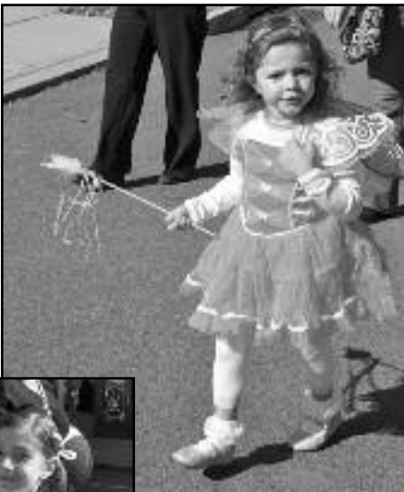
Photos can be found on Facebook at Township-of-Union-New-Jersey-Government