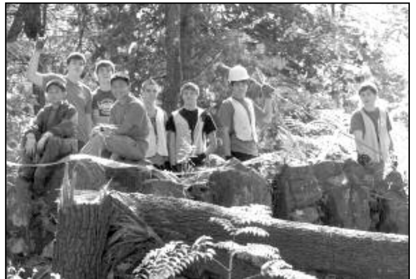
(left & Above) Boy scouts from Troop 228 at gratto.