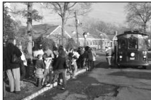
(above) The Cranford Chamber of Commerce hosted Santa Claus as he rode around town in a trolley. By the end of the day over 300 children and adults participated and were very happy as they sang songs and waved out the windows of the trolley to the many shoppers in the Downtown area. The event was co-sponsored by Two River Bank, Cranford.