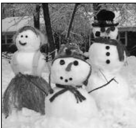
(above) Snow Family by the Unchester Family.

out to see the creations. Though the snow is on its way out, the contest will go until March 15th. Guidelines for the contest can be found on www.longhillnj.us .