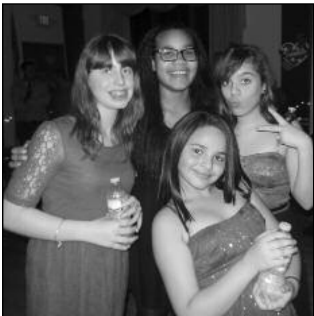
(above) Girl Scouts from Troop 65133 at Valentine's Day dance at Holy Cross Church.

March has the North Plainfield Girl Scouts springing into action with many community events. Local troops have been busy with collecting food at Walmart and Vermeule for the North Plainfield Community Food Bank, helping with clothing donations at St. Joseph's, and fundraising by selling those seasonal tasty cookies that we all look forward to. All their hard work will pay off when they take their annual trip to Camp Hoover. In February, Troop 65133 put on another successful Valentine's Day dance at Holy Cross Church. Over 75 girls scouts enjoyed dancing, refreshments and games with their fathers, grandfathers, uncles and older brothers at this annual event. Donations were collected and given to the Back Pack Program, which is offered by the Food Bank for children in our local schools. Look for your local troops selling cookies at businesses in the North Plainfield area. To find a booth sale near you, visit http://cookielocator.littlebrownie.com/