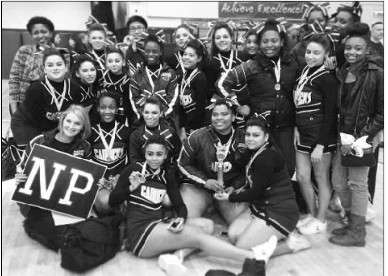
(above) The North Plainfield Canuck Cheerleaders