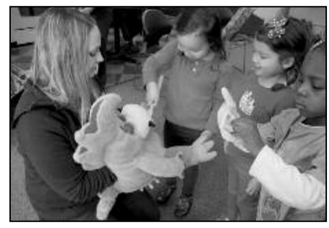
(above) Children 6 and under participated in the library's Smile Proud Program.

February was National Children's Dental Health Month. To celebrate (and keep teeth healthy), staff from the Children's Dental Center of Somerville shared a story with the children and demonstrated brushing and flossing techniques. Questions and concerns about children's dental health were answered and children left with a goody bag!