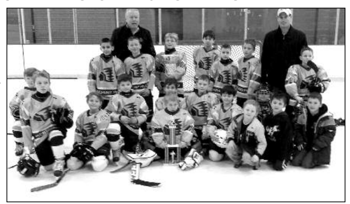
(above) Watchung Hills Junior Warrior Mites

After two straight Playoff wins against Randolph and Morristown, the Warriors ended the successful season with an 11-5-2 record, and bringing home the team trophy for the Championship game runner up. The Watchung Hills Hockey Club is holding registration for the 2014-15 season on March 21st at the Long Hill Elks from 5:00 - 7:00.