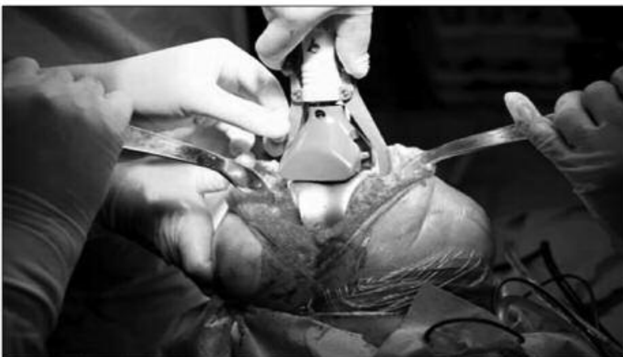
According to the American Academy of Orthopaedic Surgeons (AAOS), there are about 270,000 knee replacement operations performed each year in the United States; this image depicts the procedure.

If you are tired of trying treatments that don't provide lasting relief, or if you are afraid to try any of these treatments, don't worry. If you have tried any of these treatments and experienced little to no relief, you may still be a candidate for Viscosupplementation Therapy. Call (732) 827-0800 and schedule a no cost screening today! You have nothing to lose but your pain!