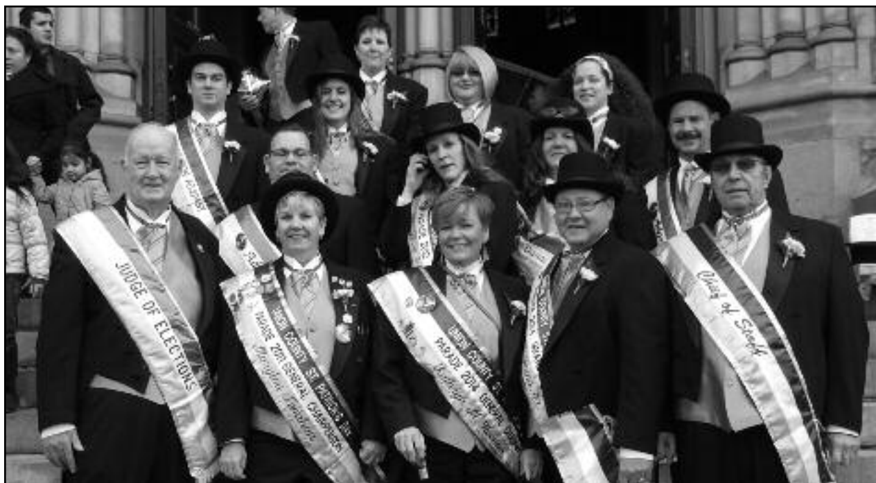
(above) 18th Annual Union County Saint Patrick's Day Parade committee.