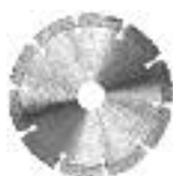
Belgium Block Diamond Blades