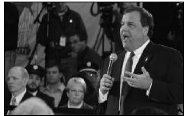
(above) Gov. Chris Christie February 26th.

with applause and started out by saying he was happy to be in his home county, County of Morris. The Town Hall Meeting lasted approximately one and three quarter hours.