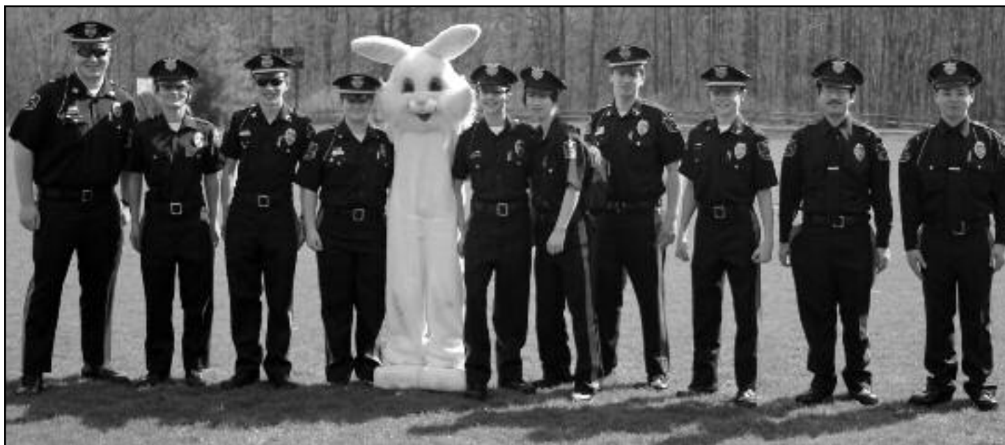
(above) Peter Cottontail thanks our Long Hill Police Explorers for all their help with the event. The Explorers helped get all of the eggs rolled out early in the morning, and then facilitated in managing the "egg hunters." They were a big contributing factor to the success of the Egg Hunt.