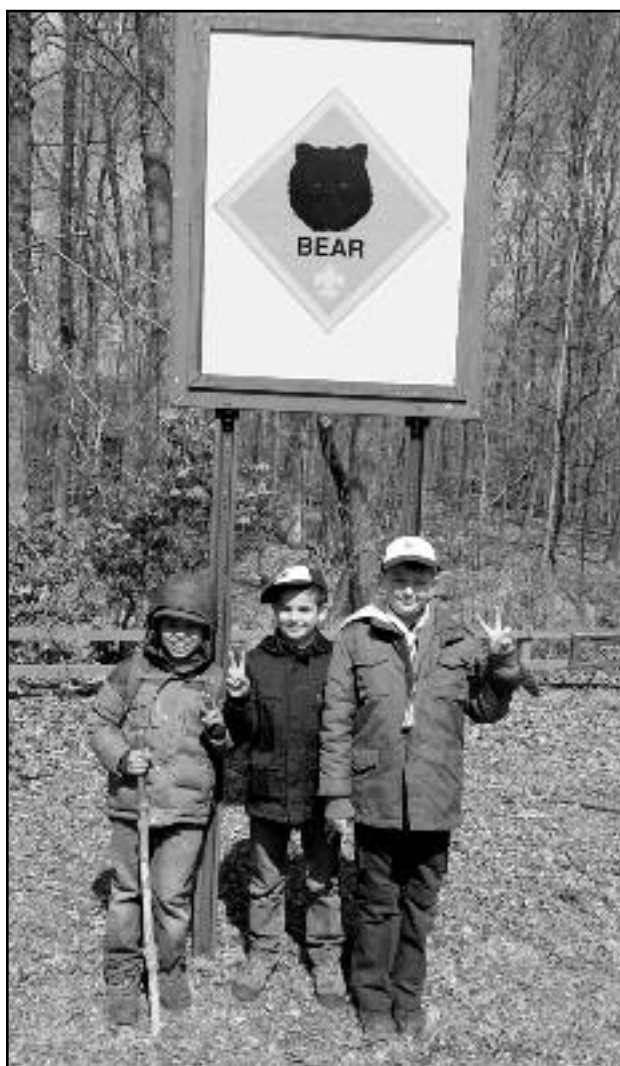
(above) Scouts from Den 6 Pack 135 showing off their scout pride at the spring beltloop bonanza at Winnebago Scout Reserve.