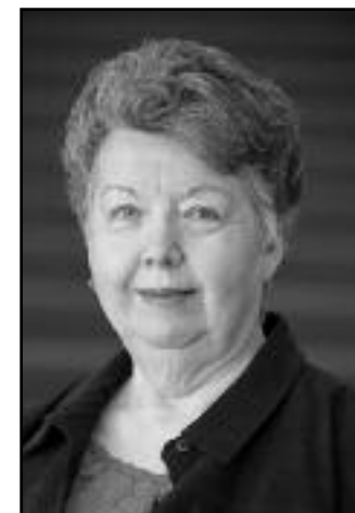
(above) North Plainfield resident and volunteer with Barnabas Health Hospice and Palliative Care Center in West Orange.

For information about volunteer opportunities at Barnabas Health Hospice and Palliative Care Center, please call 973-322-4800.