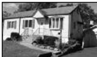
8 Park Drive - Kenilworth