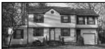
3 Venetia Ave. - Cranford