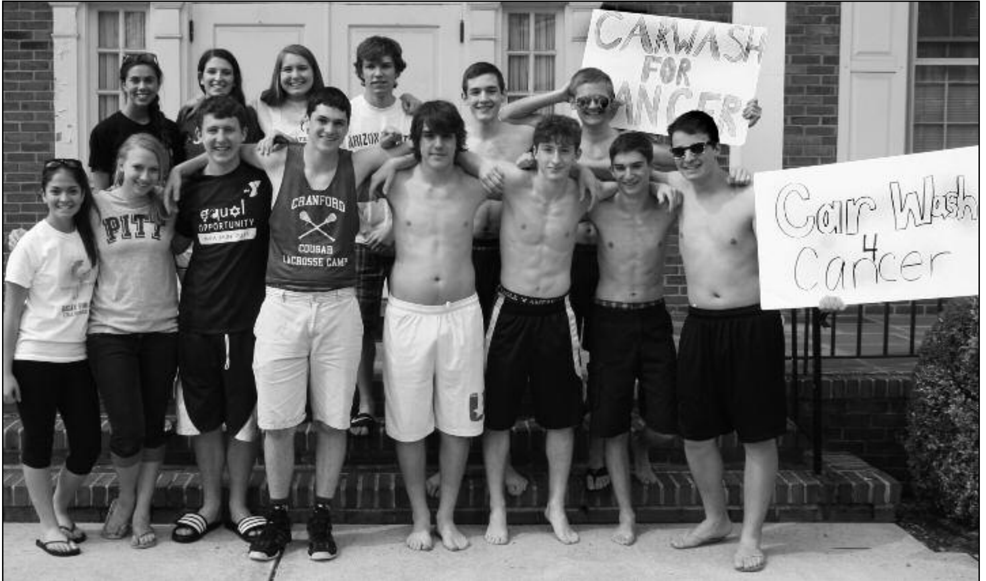
(above) Relay For Life team Walking Warriors held a fund raising car wash at Dooley's Funeral Home on April 26th.