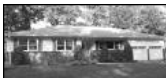
616 Riverside Drive - Cranford