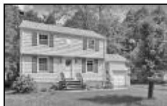
6 Venetia Ave. – Cranford

AT ERA MEEKER REALTY WE DON'T JUST SELL HOUSES WE HELP MAKE DREAMS COME TRUE.