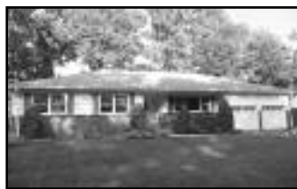
616 Riverside Drive - Cranford