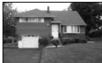
11 Collins St. – Cranford

Whether you are a first-time buyer, move-up buyer or investor looking for a single or multi-family home, condo or townhouse, ERA Meeker Realty agents can help you find the perfect home, negotiate with the sellers and share their local knowledge to help you navigate the entire home buying process.