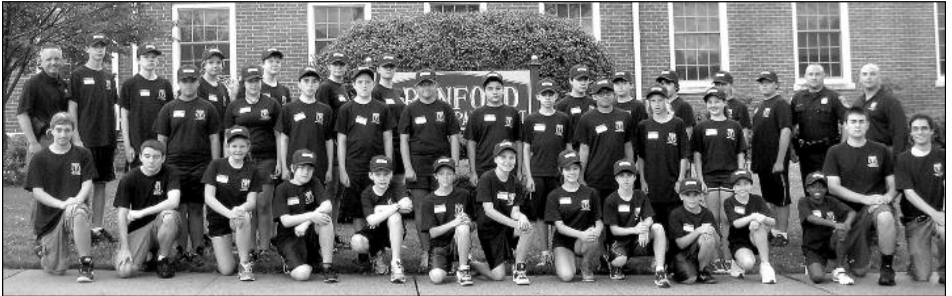
(above) Cranford Police Youth Academy class of 2012