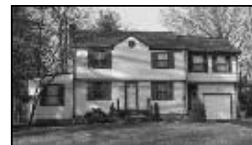
3 Venetia Ave. - Cranford