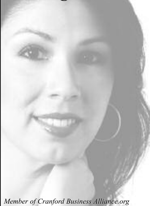
Member of Cranford Business Alliance.org

A missing tooth is no laughing matter. We make getting implants easy and inexpensive. From a single tooth to several teeth, a complete smile is just a phone call away.