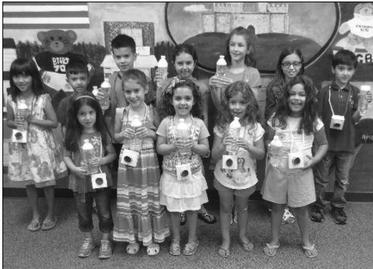
(above) Children display their decorated box cameras, and their tornado in a bottle.

To register or for more information call (908) 276-2451 or visit 548 Boulevard.