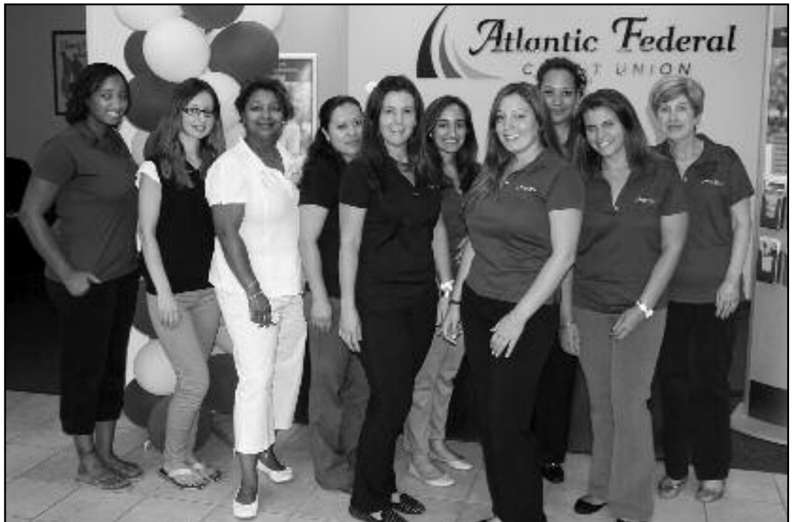
(above) The staff of Atlantic Federal Credit Union at grand re-opening celebration.

Anyone who lives or works in Union County can become a member of Atlantic Federal Credit Union.