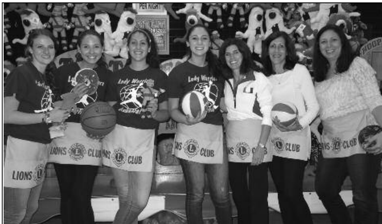
(above) Lions volunteers show their "stuff."

EXPO is the major fundraiser of the Warren Lions Club, and enables the Club to donate to local charities, organizations and events. For more information, go to warrenlionsclub.org .