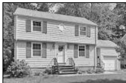
CANFORD - $369,000