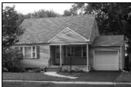
CANFORD - $369,900