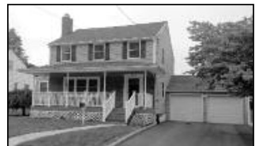
LINDEN - $387,500