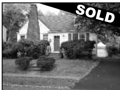
CANFORD - $429,000

AT ERA MEEKER REALTY WE DON'T JUST SELL HOUSES WE HELP MAKE DREAMS COME TRUE.