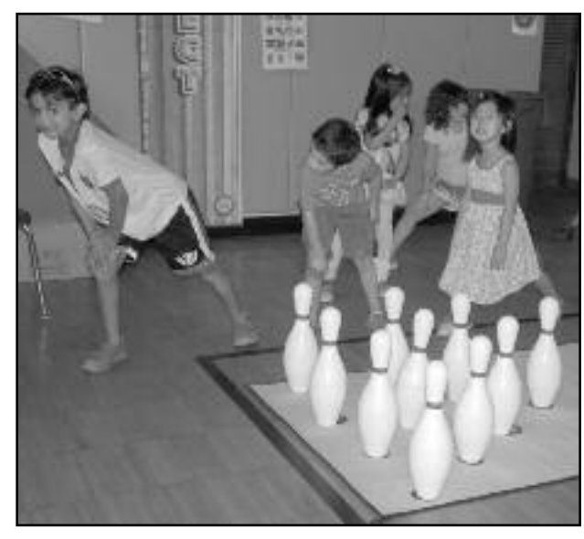
(above) Cosmic bowling was a big hit!