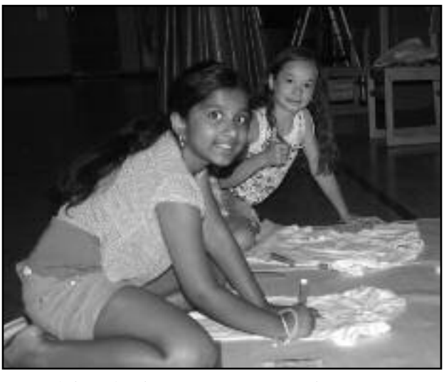
(above) These campers are designing "Cosmic tee shirts."

Camp PAWS has concluded its 3rd year of students with her friends—her parakeet and her dragon. During week three, students experienced an Astronaut Skype visit, an Astronaut Food Tasting, and the Astronaut games. Week four, students experienced Star Lab as well as a field trip to the RVCC Planetarium. During week five, students had a 'splashdown" at the Green Brook Swim Club (July 31st). During the sixth and final week of Camp PAWS 2014, students built and launched self-made rockets. It has been a great summer here at Camp PAWS. Thank you for your support!