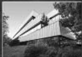
2 Riverview Dr, Somerset, NJ (Conveniently located off I-287)