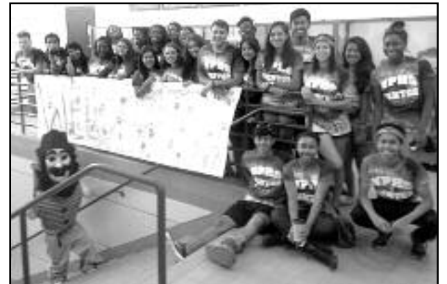
(above) Mentors get together to prepare for games, speeches, and "welcome" signs before greeting the incoming freshmen.