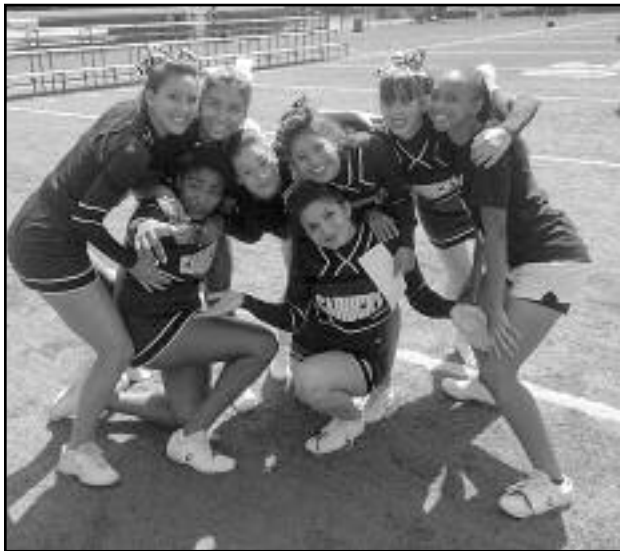
(above) North Plainfield's cheerleaders get ready at the high school's football field before taking their Football/Cheerleading photos.