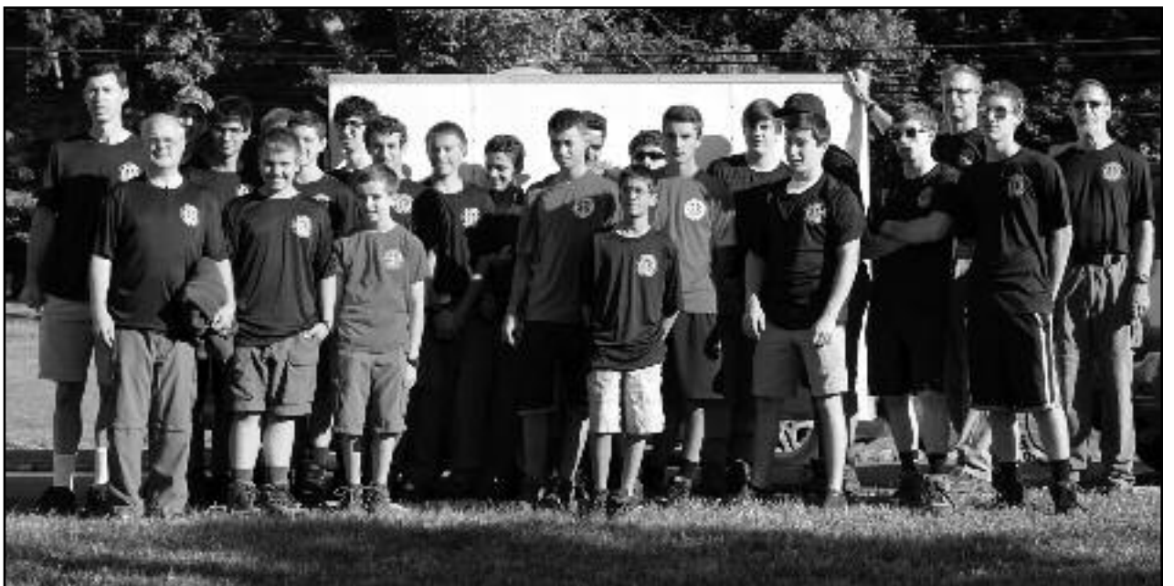
(above) Troop 228 boys and adult leaders leaving for their annual week-long summer troop camping trip at Sabattis, in upstate NY on July 5, 2014.