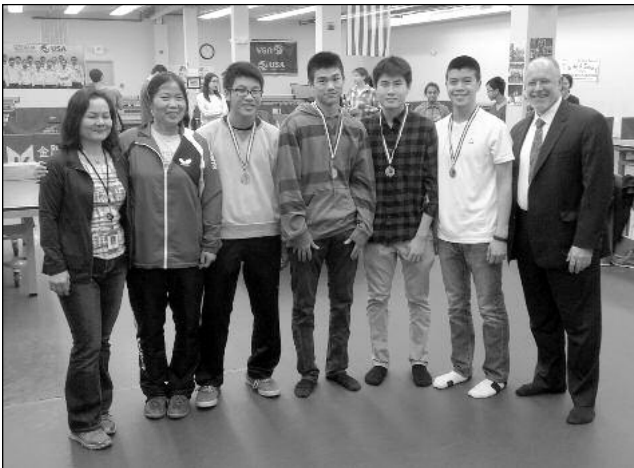
(above) Winners of Watchung Hills High School Tournament at the LYTTC.