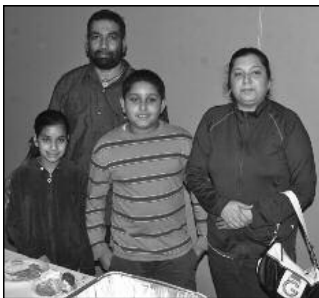
Star of India