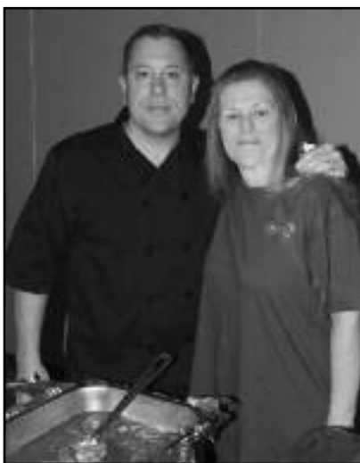
Rinaldi's Italian Bistro