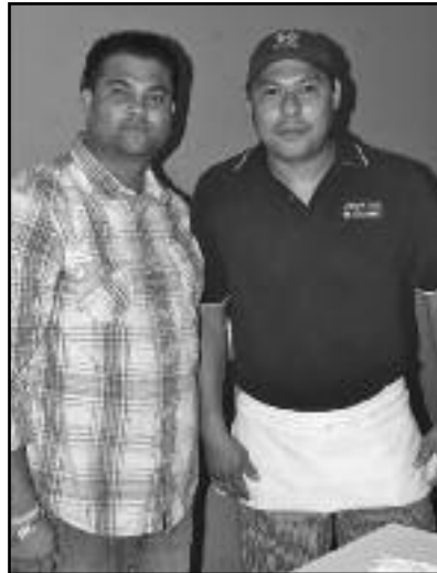
Umberto's Clam Bar