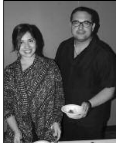
Old City Café & Grill