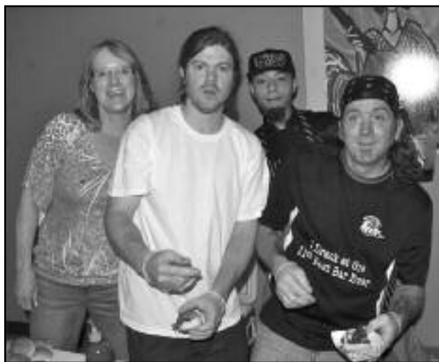
10th Street Live