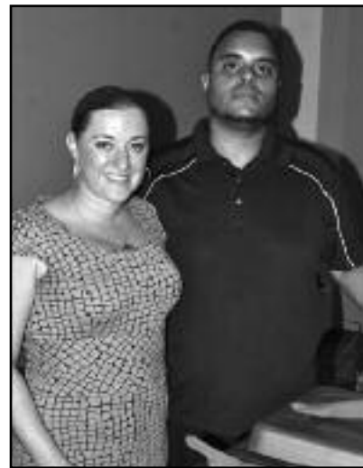
Blackthorn Irish Restaurant