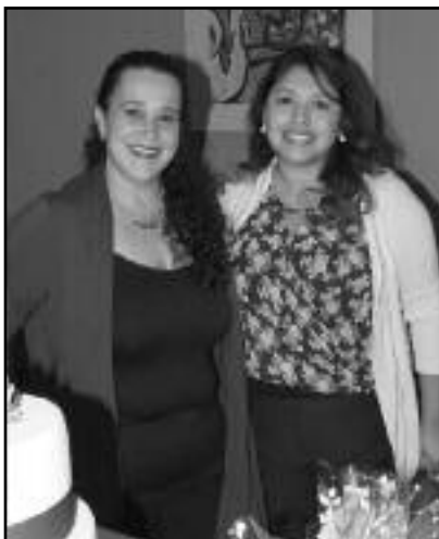
Bella Palermo Bakery